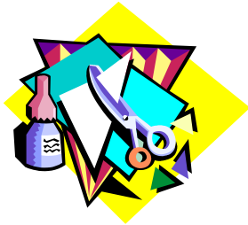
Leave materials on the table until my teacher gives me instructions