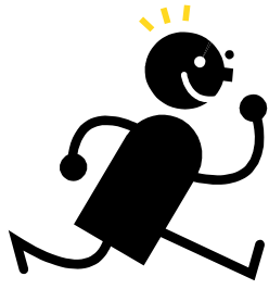
Running in the Library