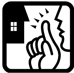
Use quiet voices